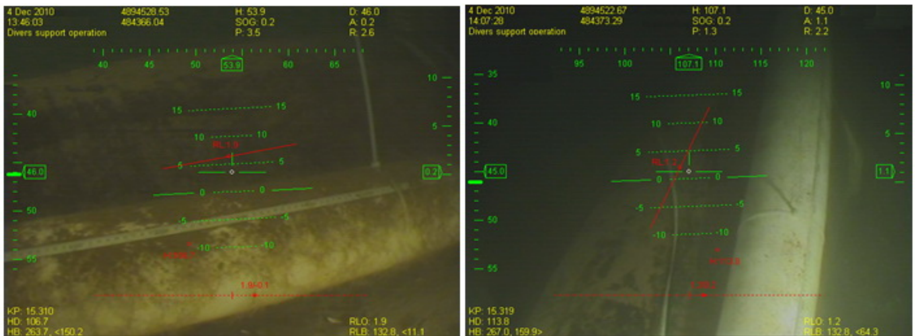
Picture 3. Screenshots of operating monitors